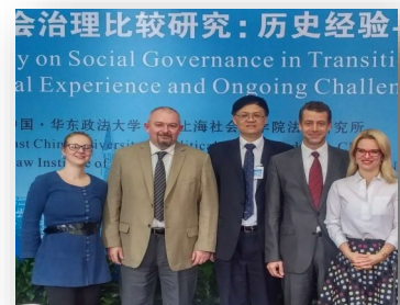
Faculty members at the III. Sino-European international legal forum

Based on the cooperation agreement concluded with the American University of Central Asia, Bishkek, Kyrgyzstan, Summer School of Human Rights was organized in Kyrgyzstan in September 2016 with the participation of three of our teachers and five students. This year's program focused on the issue of human rights in the post-transition societies. The second Summer School of Human Rights will be held in Croatia in June 2017.